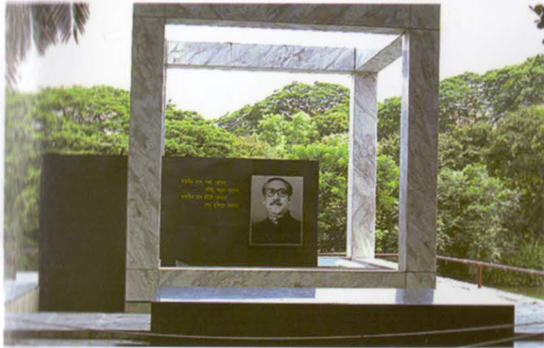
Bangabandhu Memorial Museum

Three Leaders Mausoleum is an interpretation of the traditional Islamic architecture motif of arch.