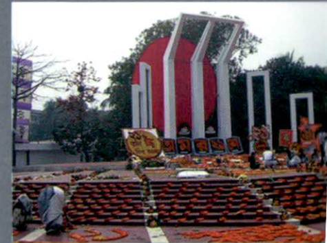
Central Shahid Minar

1971. Once known as a city of 52 bazars and 53 lanes, Dhaka has a happy blend of Mughal, Victorian and modern architectures as well as a number of historical relics. The recent spurt in high-rise buildings is fast changing Dhaka's skyline. The city still has a name for its exotic culinary and cuisine and was once known worldwide as a City of Mosques and Muslim. Nearby is Sonargaon, the old capital and throbbing