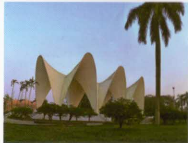
Three Leaders Mausoleum