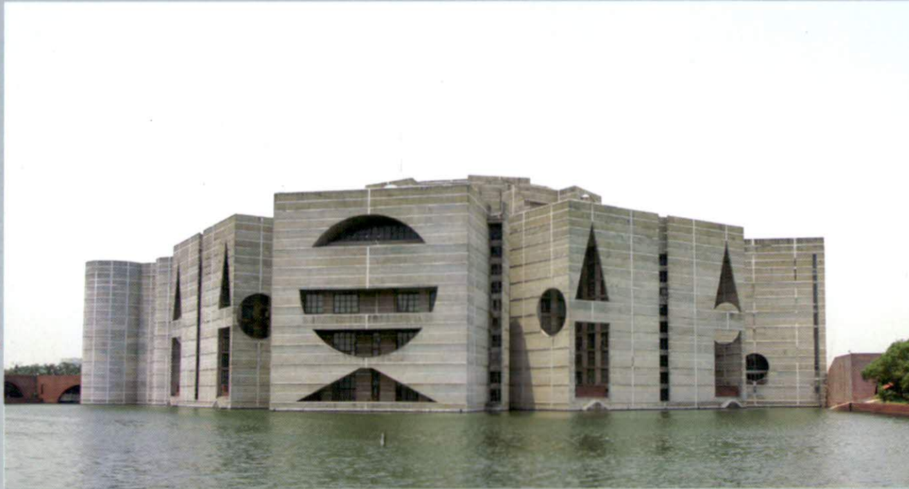
National Assembly Building

river port of Narayanganj-The main trading. With its spacious national museum, lush green parks and zoo, serpentine lakes, tree-lining streets, open air bazaars and colorful modern shopping plazas laden with traditional handicrafts and other items, posh and modern luxury hotels, Dhaka displays the exotic beauty of an enchanting oriental capital city. Art and artifacts, theatres, dance drama and music having inimitable local touch flourish in Dhaka making it the country's prime cultural hub.